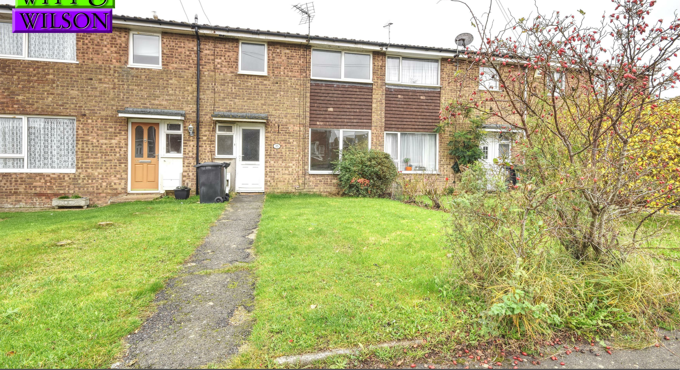
35 Kinver Lane, Bexhill-On-Sea, East Sussex TN40 2SB £265,000